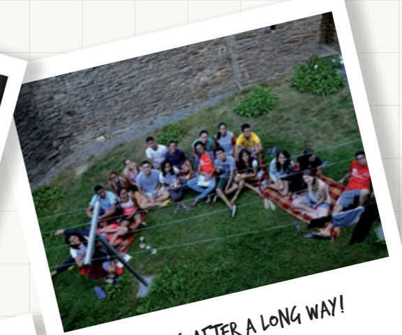
RESTING AFTER A LONG WAY!