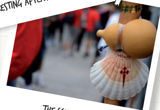
THE SCALLOP SHELL