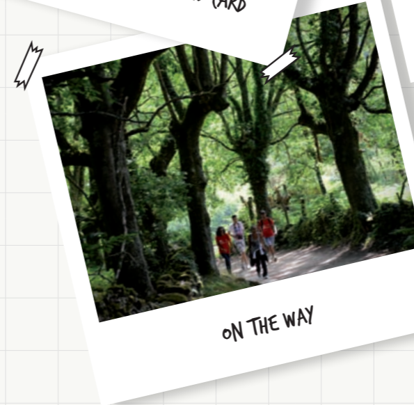
ON THE WAY